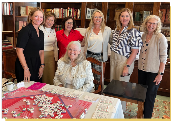
TUESDAY, FEBRUARY 11, 18, 25: BEGINNER MAHJONG LESSONS