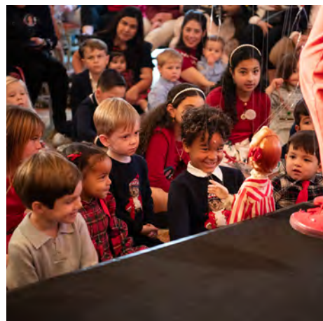
The Bob Baker Marionette Show at the Children's Christmas Brunch