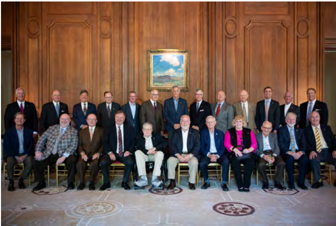
Our 25+Year Members at the 1887 Society Luncheon