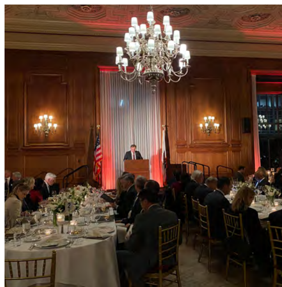
WEDNESDAY, JANUARY 22: THE 138TH CALIFORNIA CLUB ANNUAL MEETING

Thursday, January 30: Lunar New Year Celebration