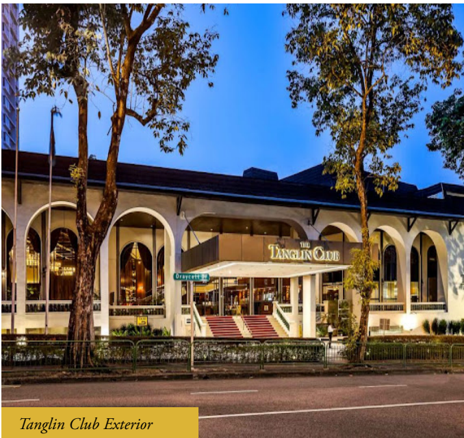
Tanglin Club Exterior

Visit www.tanglinclub.org to learn more about this esteemed club.