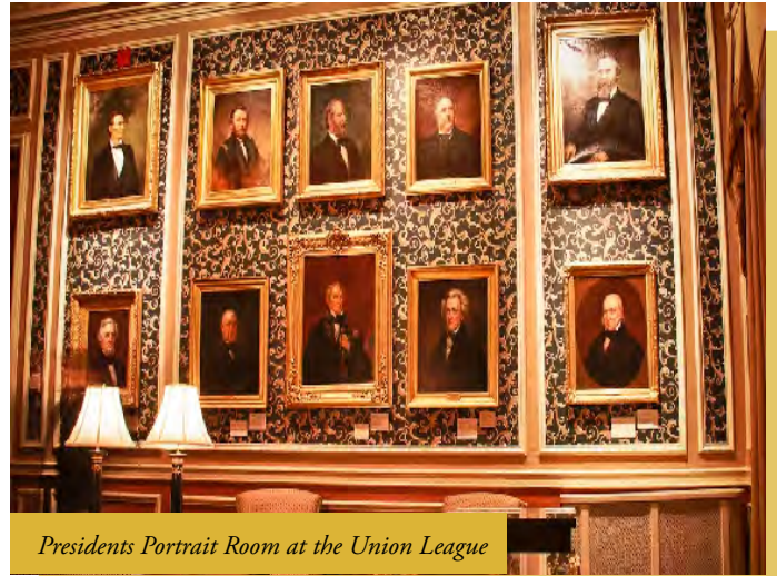
Presidents Portrait Room at the Union League

from City Hall, the Academy of Music, the Kimmel Center, excellent restaurants, theaters, historic sites, museums and shopping.