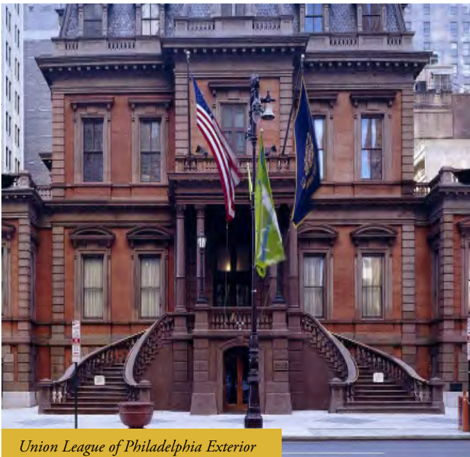
Union League of Philadelphia Exterior

You can learn more about the Union League at https://www.unionleague.org