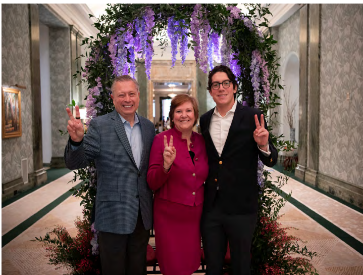
SUNDAY, MAY 10: MOTHER'S DAY BUFFET