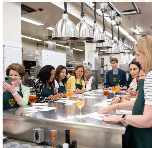
MONDAY, JUNE 15: WOMEN'S COMMITTEE "IN THE KITCHEN" COOKING CLASS