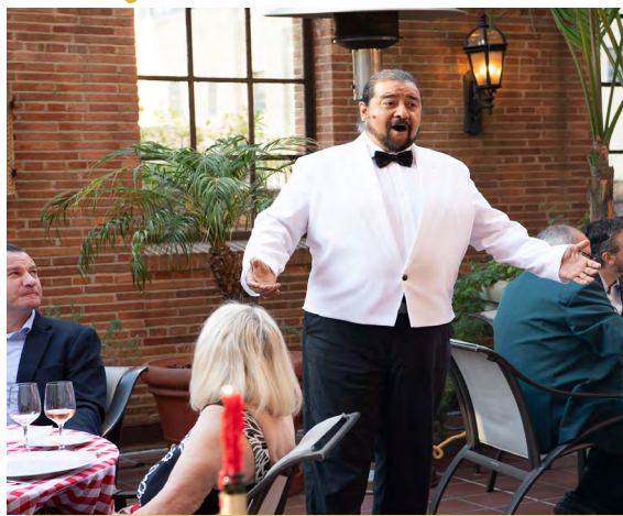
WEDNESDAY, JULY 29: SUMMER COOKOUT "THAT'S AMORE"