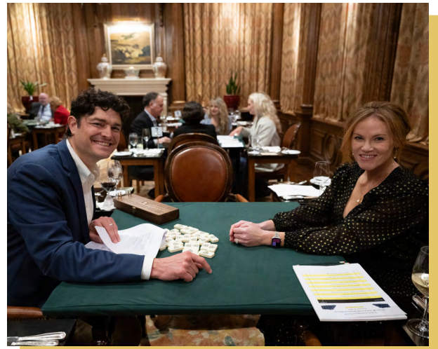
THURSDAY, APRIL 30: THE JAMES R. SHOCH DOMINOES SOCIAL DINNER

Thursday, April 30: The James R. Shoch Dominoes Social Dinner